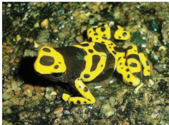
FIGURE 1. Adult Dendrobates leucomelas from near Puerto Ayacucho, Venezuela.

• DEFINITION. Dendrobates leucomelas is a relatively large Dendrobates with a SVL ranging from 30.5–37.5 mm. The skin of the back is smooth while the posterior belly and ventral surface of the thighs are rugose (Silverstone 1975). The fingers are free and end in large discs that are truncate with converging margins. The first finger is shorter than the second and the disk is smaller than the others. The toes are also free but with smaller disks than on the fingers (Rivero 1961). Dendrobates leucomelas is 1 of 2 species of dendrobatids that lack an omosternum (Silverstone 1975). The dorsal coloration is largely black dominated by 3 broad yellow transverse bands, but can be greenish-yellow or orange in some populations (Lötters et al. 2007). The yellow bands typically contain black spots, bands, or intrusions (Silverstone 1975). In some areas the bands are orange or yellow, becoming greenish yellow at the extremities. The ratio of black ground color and colored dorsolateral bands varies (Fuentes and Rodriguez-Acosta 1997). Ventral surfaces are black with occasional lateral intrusion of yellow from the dorsal surface or a yellow spot (Rivero 1961). The limbs are yellow spotted with black (Silverstone 1975). The advertisement call of a male is a relatively loud, monotonous, but musical trill (Lötters et al. 2003). The trill can last from a few seconds to several minutes and serves as an