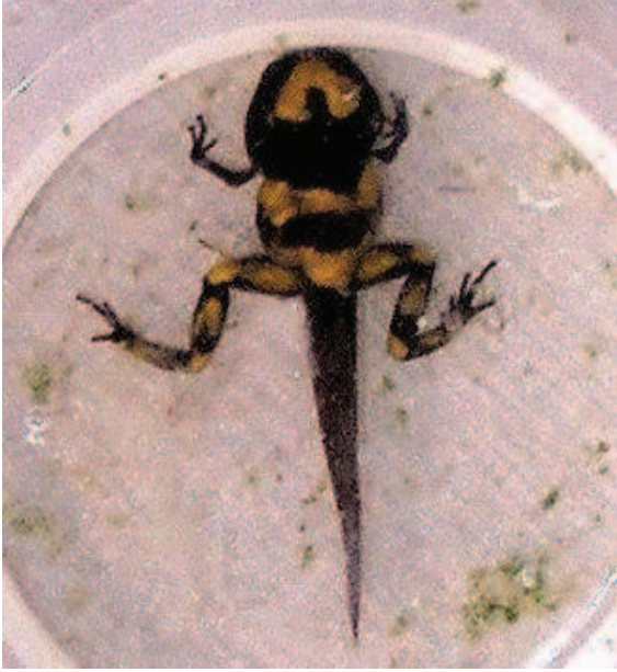
FIGURE 3. Metamorph of Dendrobates leucomelas on day 71 after oviposition in captivity.